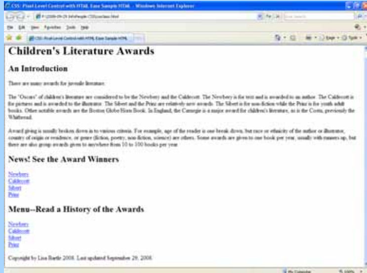
Cascading Style Sheets (CSS): Pixel-Level Control with HTML Ease