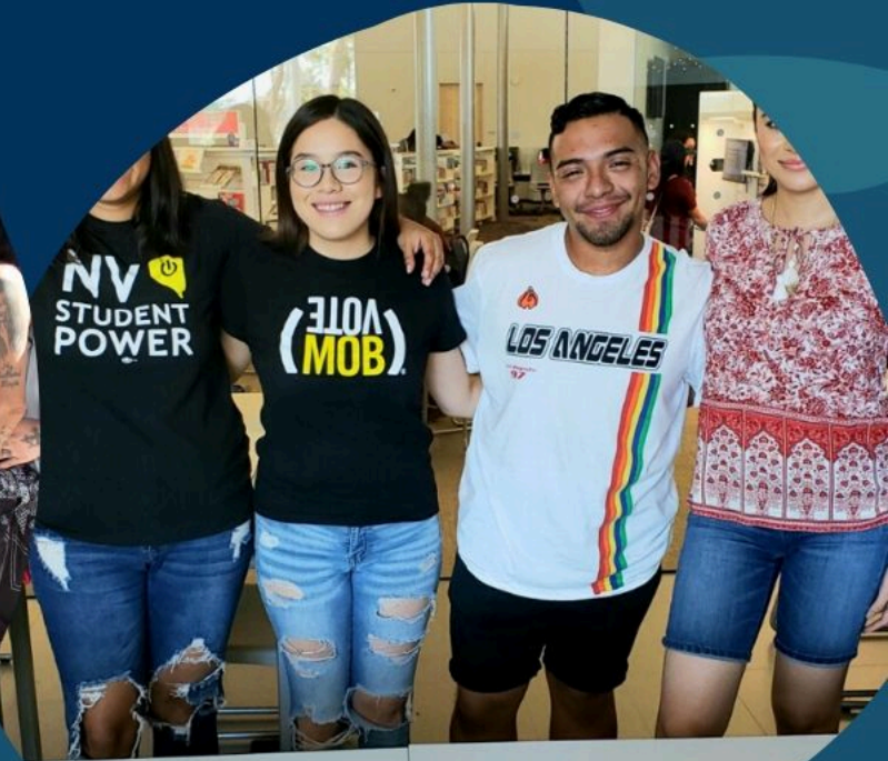
Nevada Student Power