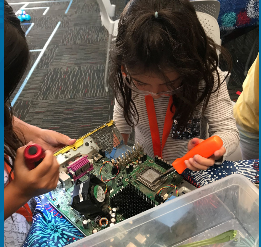
Oceanside Public Library