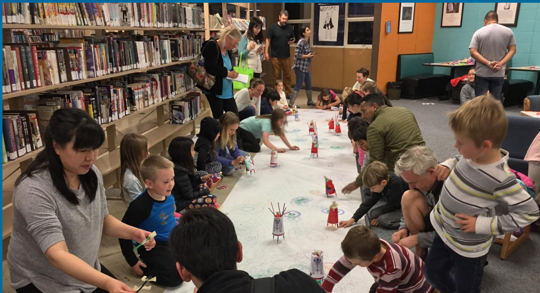
Contra Costa County Library