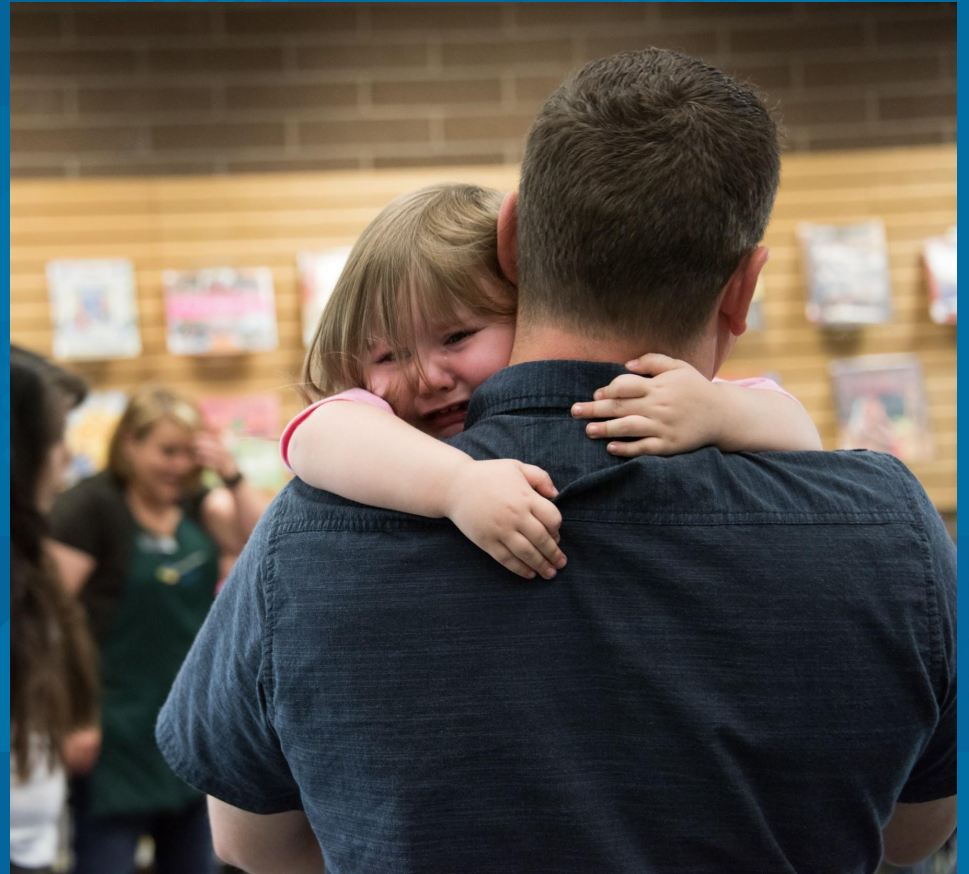
Terry Lorant Photography, CA State Library LSTA Grant