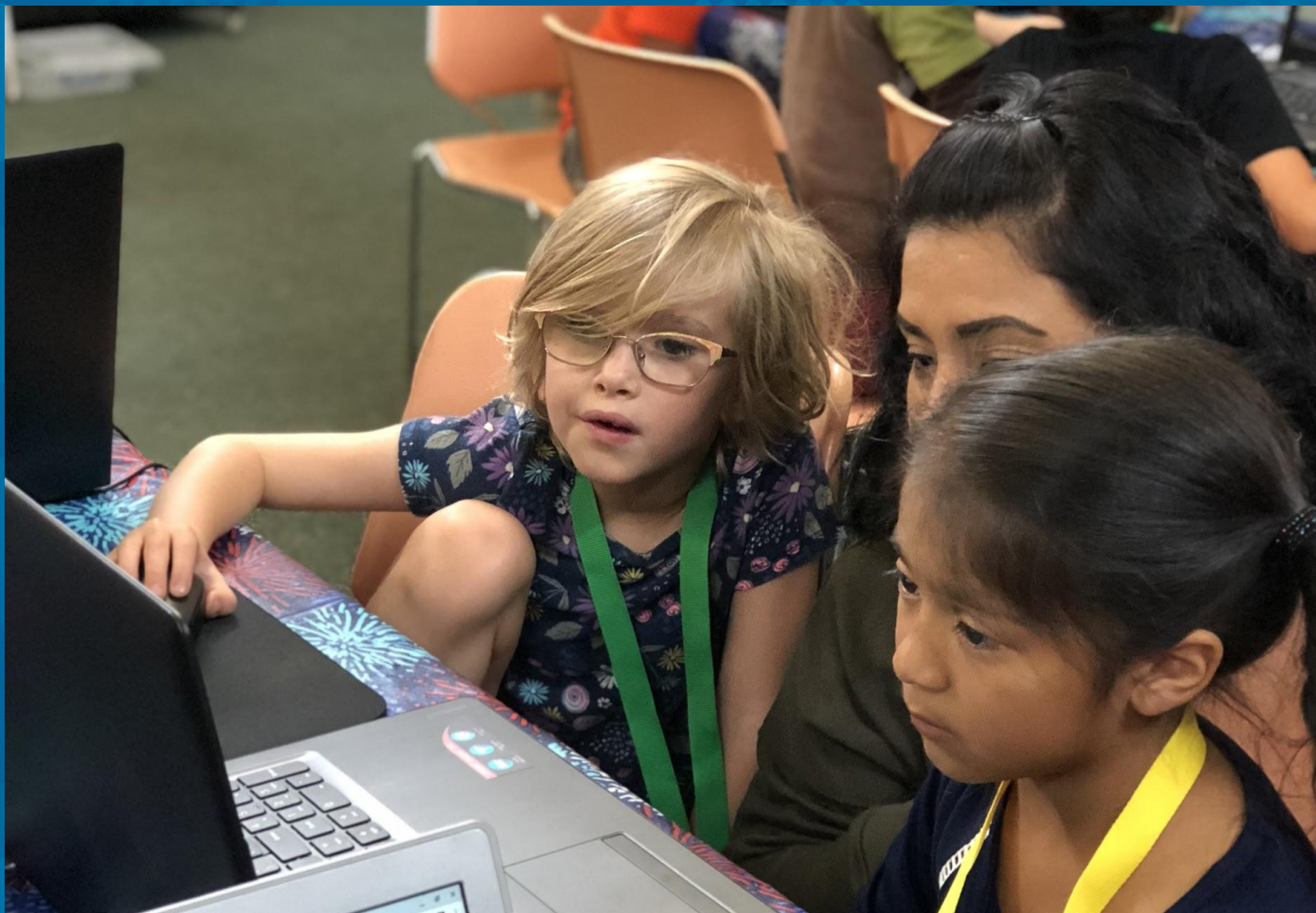
Oceanside Public Library