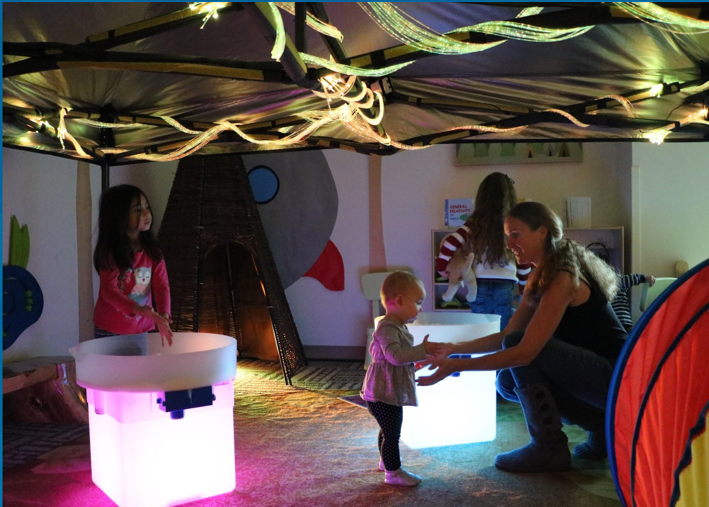
Rancho Cucamonga Public Library