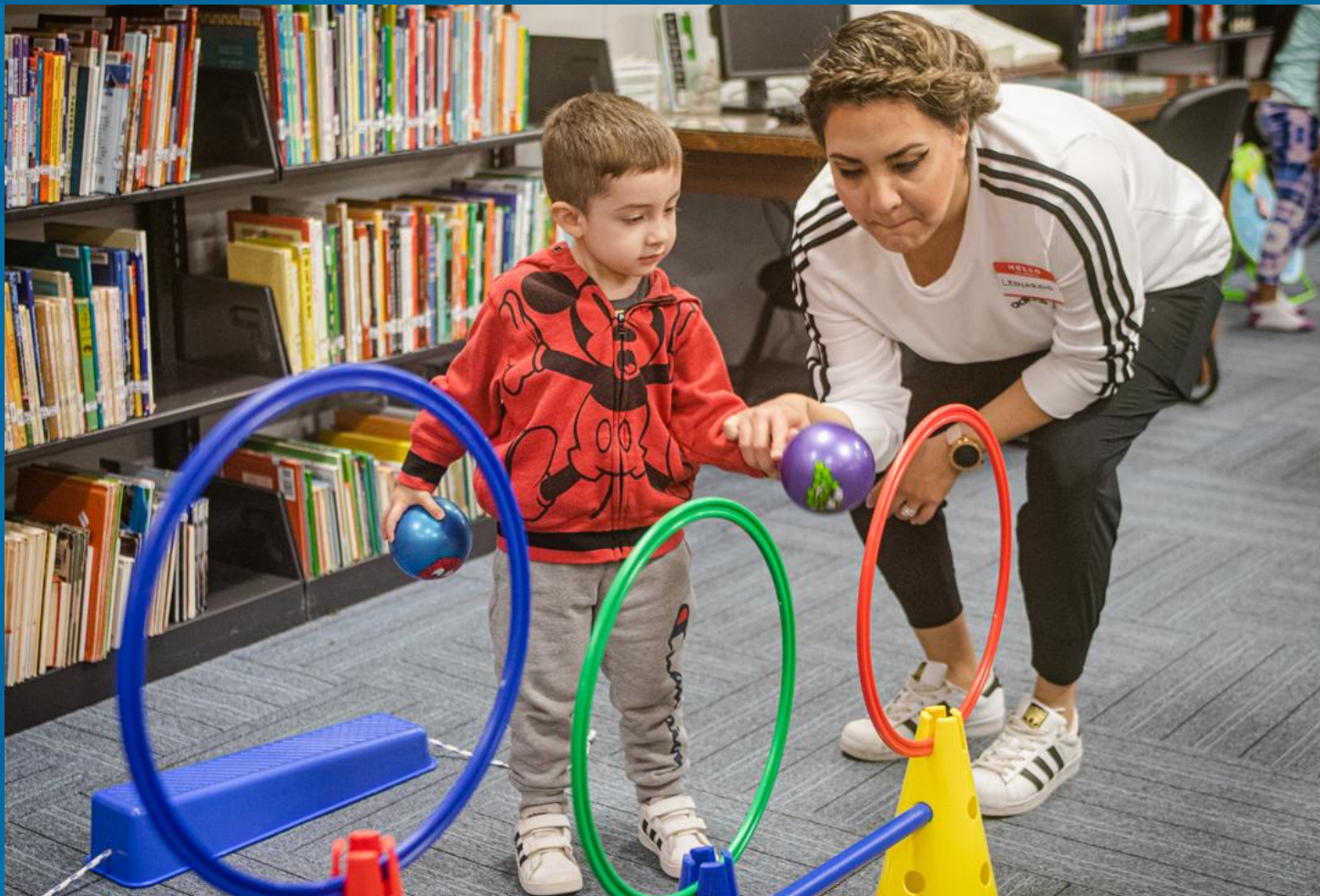
Imperial County Free Library