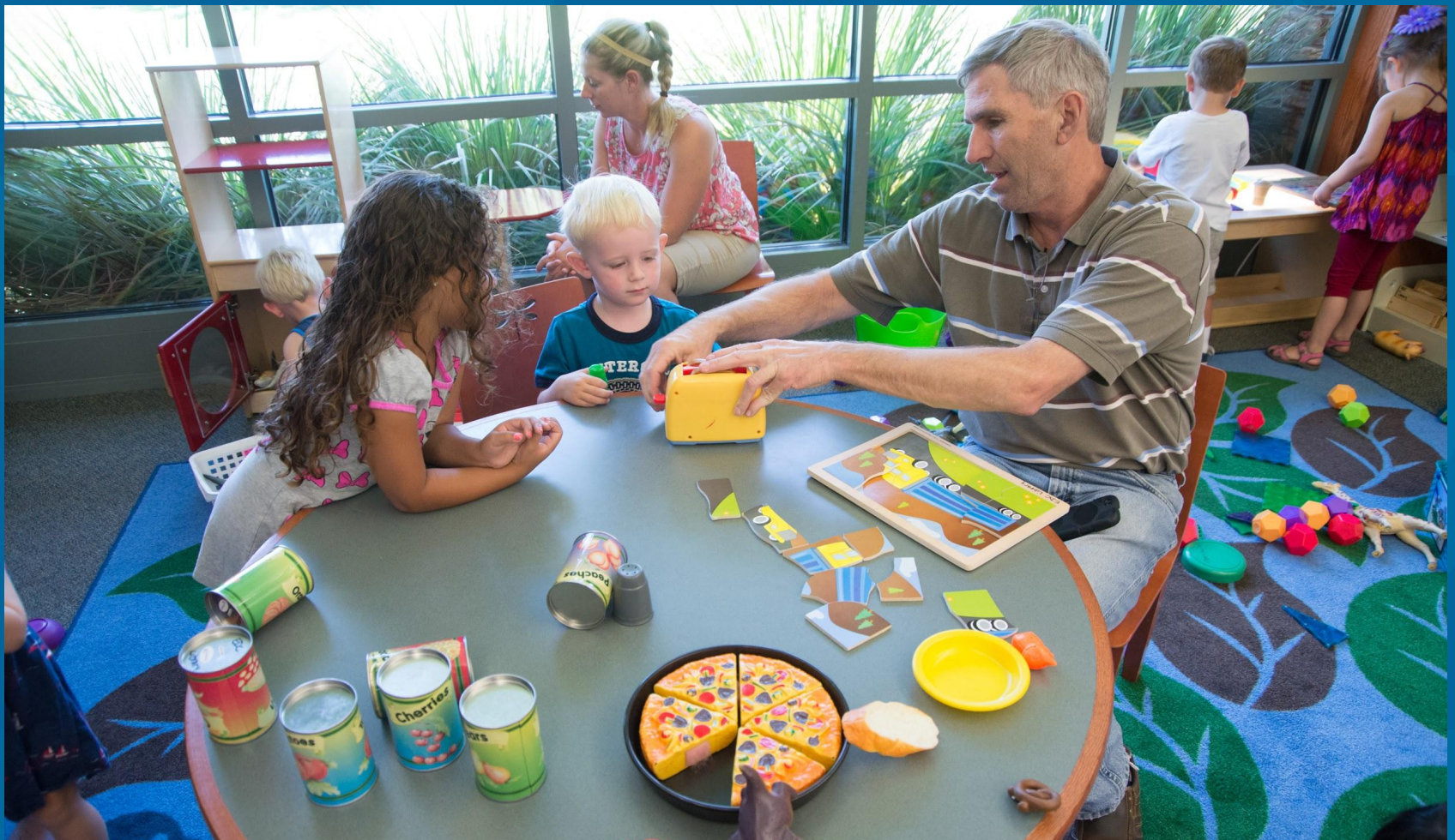
Terry Lorant Photography, CA State Library LSTA Grant