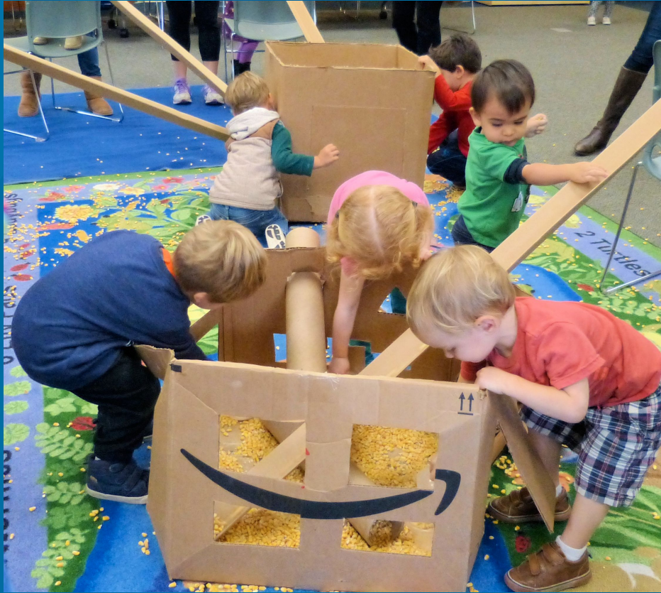
El Dorado County Library