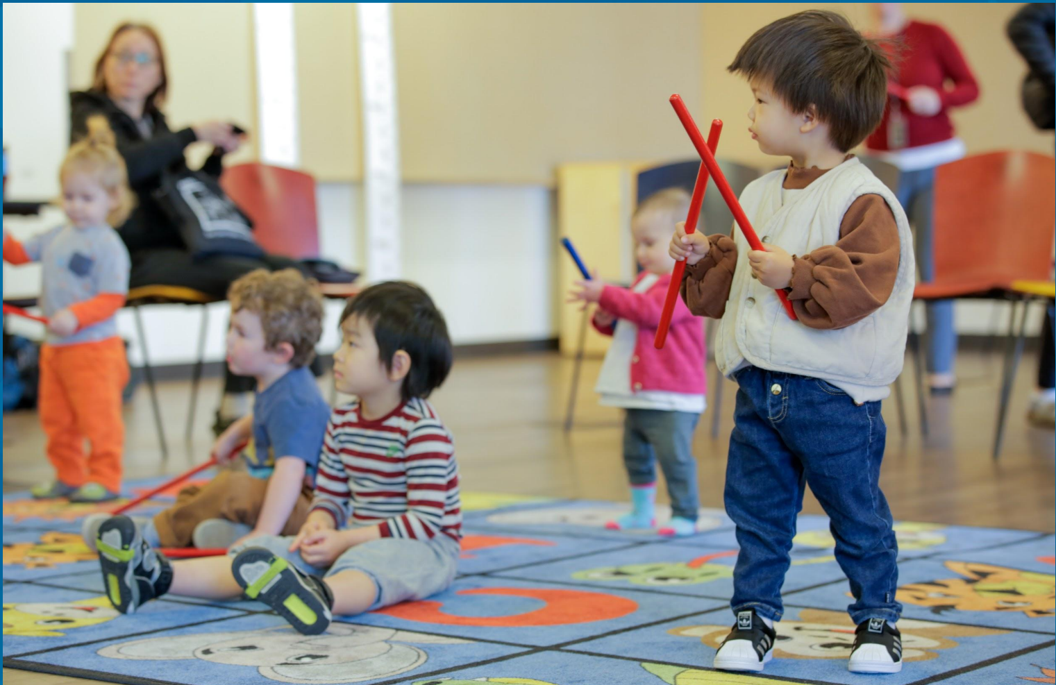
San José Public Library