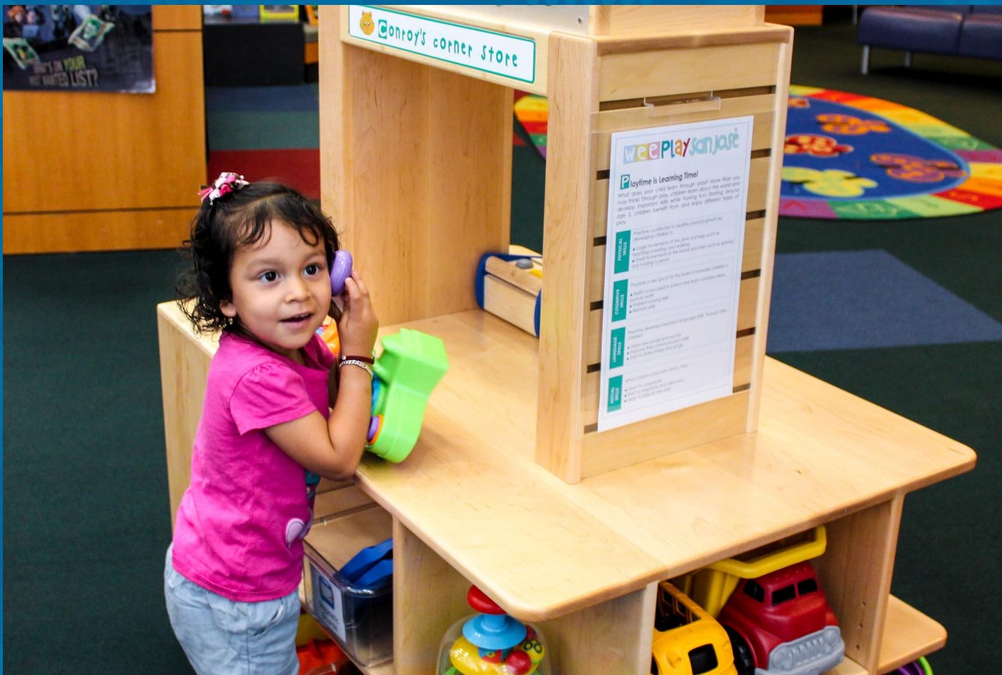
San José Public Library