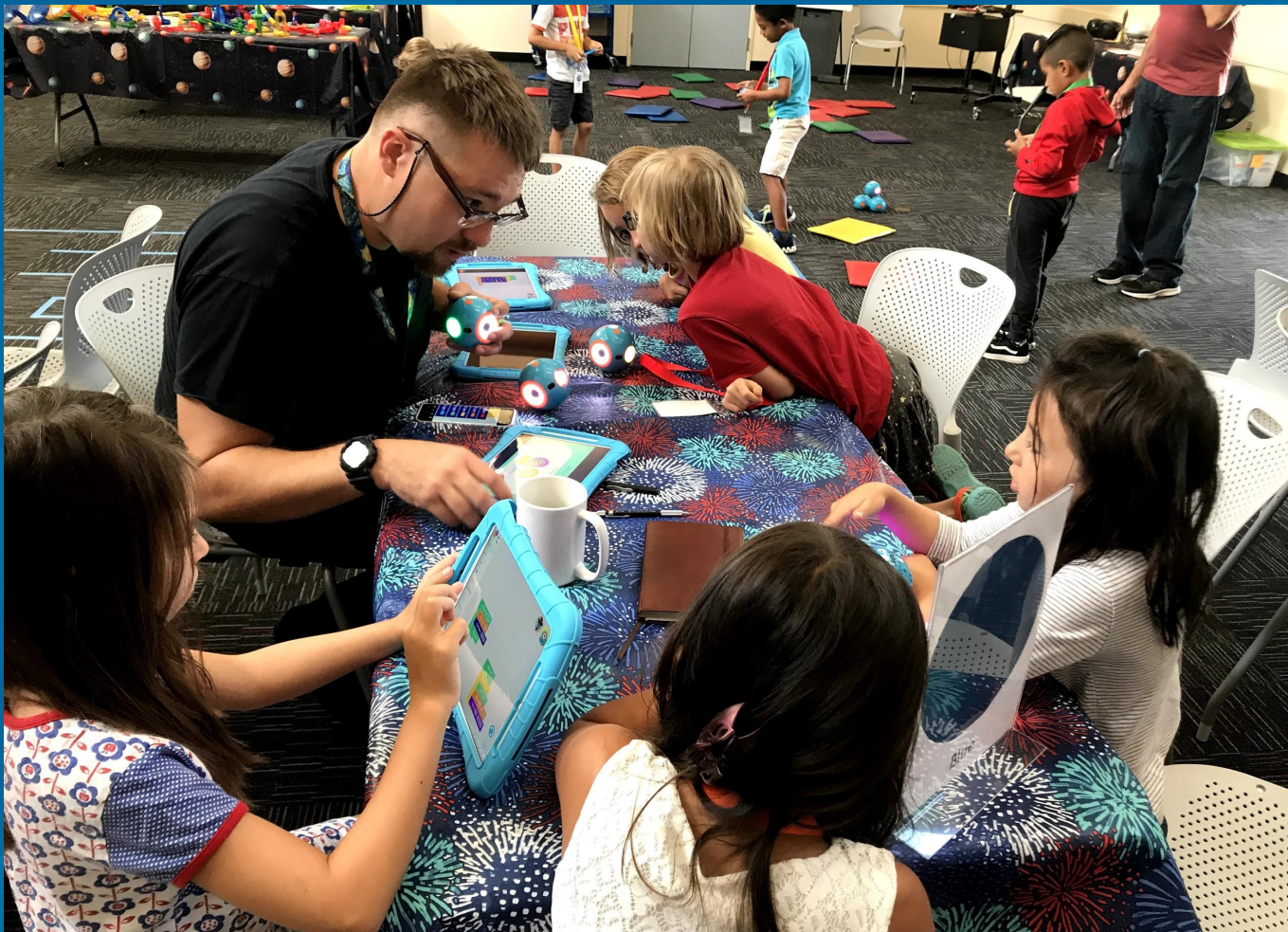
Oceanside Public Library