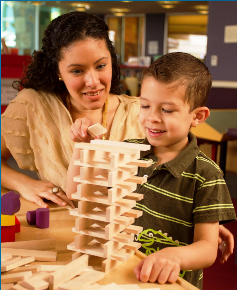
Rancho Cucamonga Public Library