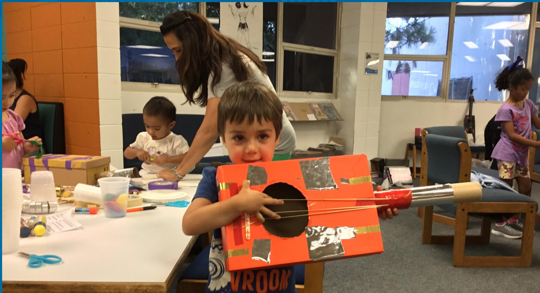
Contra Costa County Library