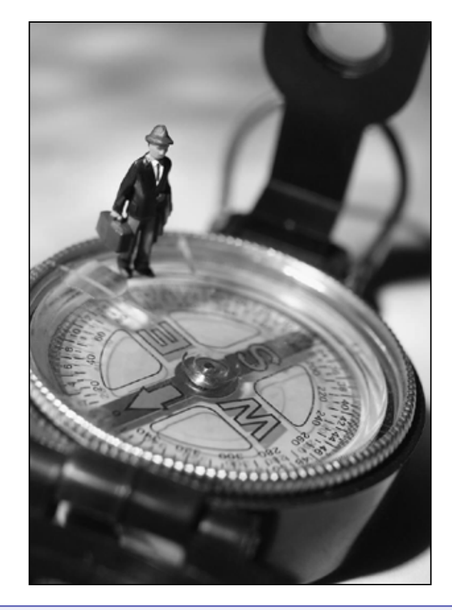
Are there military families in your community?